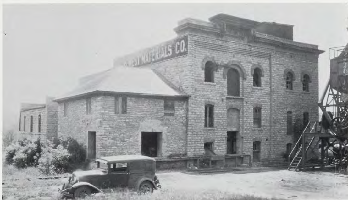
A stone remnant of the Banholzer Brewery, as it looked in 1936.