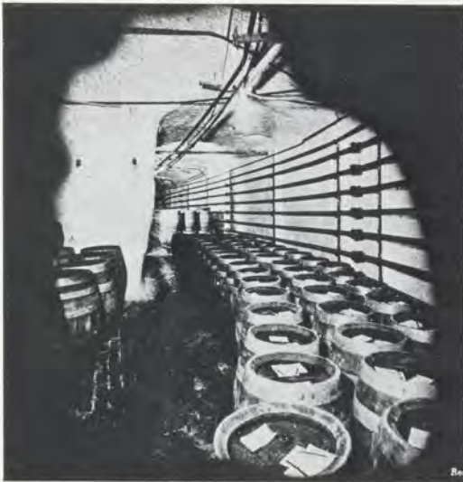
Barrels of Yoerg's "Golden Treasure," stored in a cave and ready for delivery.

large market the capital city provided) was the easy availability of the aging caves. In the pre-electric world of 19th century brewing, underground refrigeration was a necessity. St. Paul's Mississippi river bluffs not only provided a number of deep caves, but the soft texture of these sandstone terraces made it relatively easy to artificially create cooling caverns. Thus, in St. Paul brewers were spared the expense in time and money of building costly brick cold cellars — a savings that was particularly helpful to small-time operators with little capital. At one time or other, at least fourteen different local breweries took advantage of St. Paul's sandstone terraces. 4 The following account is the story of seven of the most significant of those breweries.