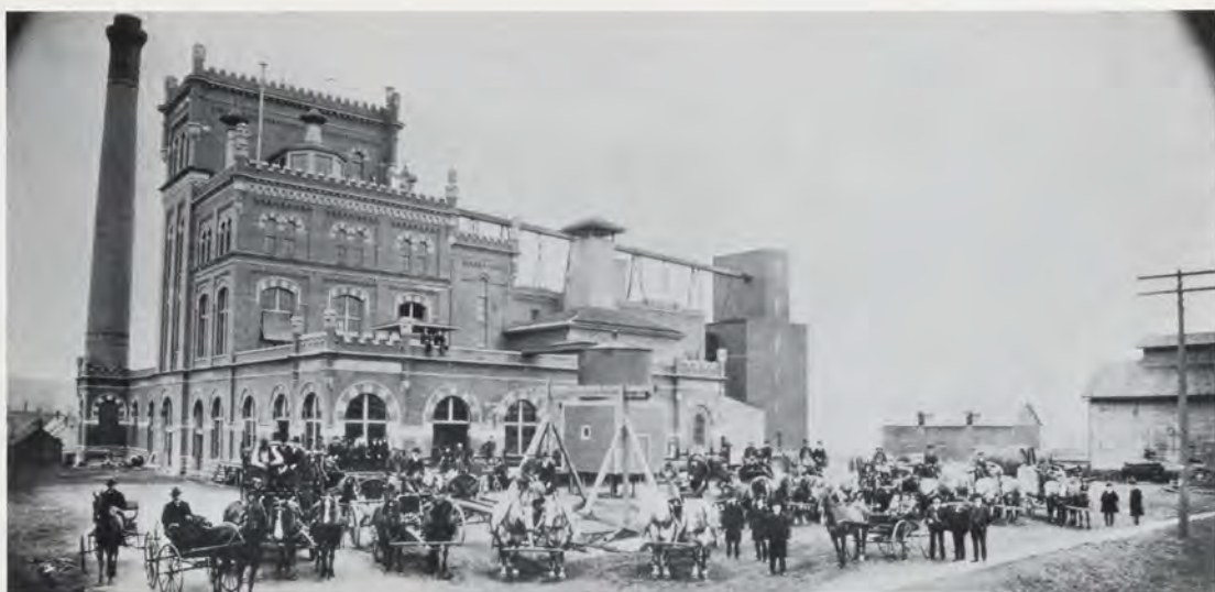
Schmidt Brewery, as it looked about 1905.