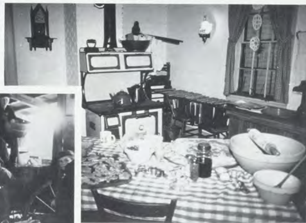
Summer kitchen as it looks today.