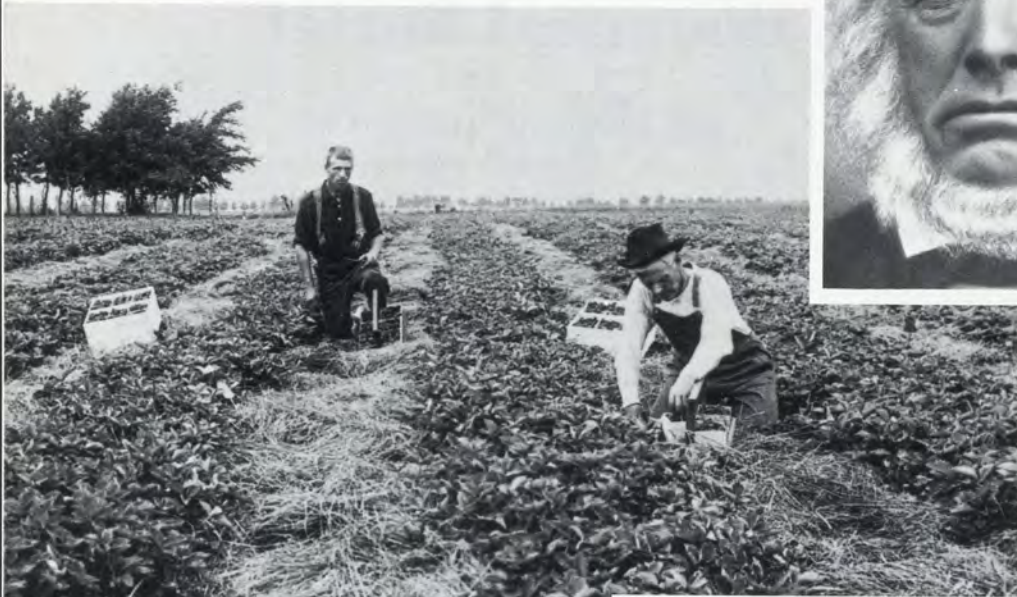
Picking raspberries in Bloomington.