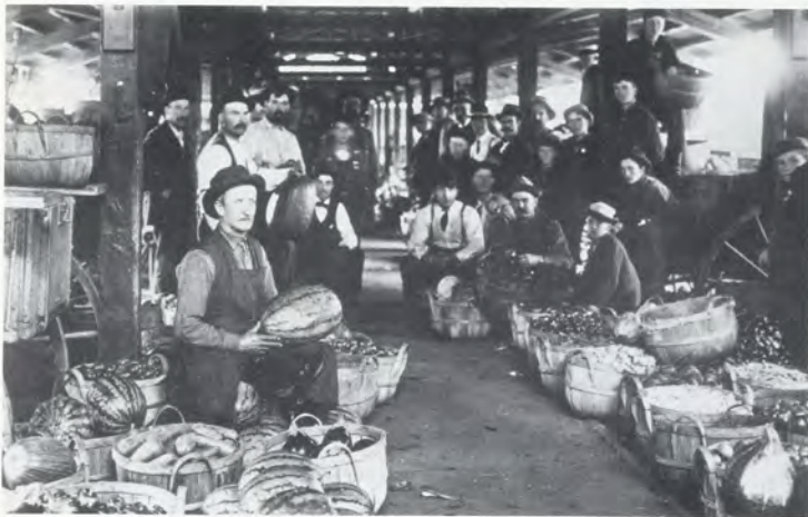
Farmers market, probably in Minneapolis, ca. 1900.

The Gibbs Farm Museum, owned by the Ramsey County Historical Society, at Cleveland and Larpenteur in Falcon Heights.