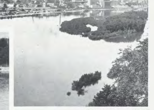
St. Paul about 1894.

Minnesota Boat Club shell races, ca. 1890.