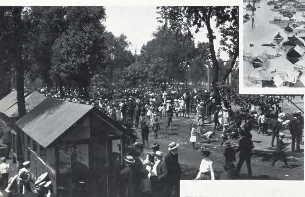
Harriet Island in 1910.

the Ramsey County Historical Society 323 Landmark Center 75 West Fifth Street St. Paul, Minn. 55102