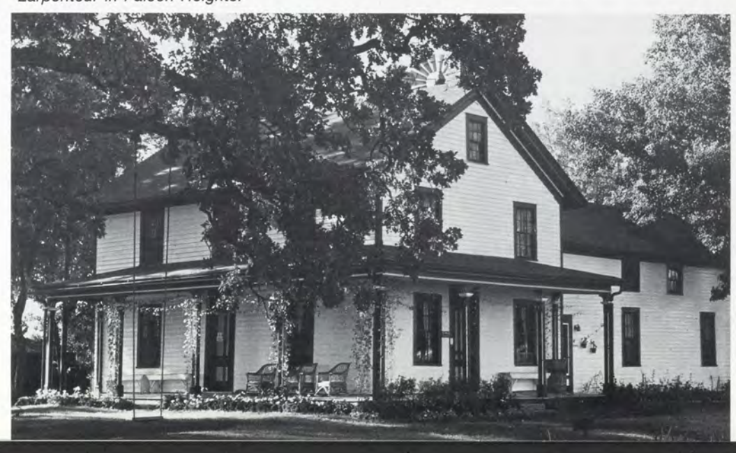
The Gibbs Farm Museum, owned by the Ramsey County Historical Society, at Cleveland and Larpenteur in Falcon Heights.

NON-PROFIT ORGANIZATION U.S. Postage PAID St. Paul, MN Permit #3989