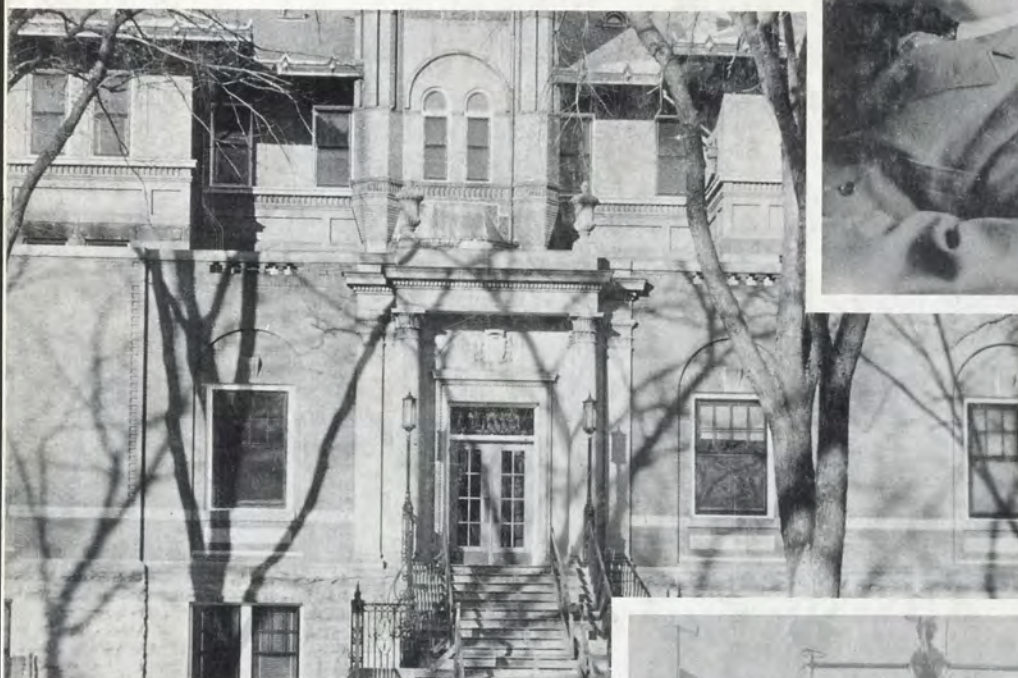
Entrance, City-County Hospital.