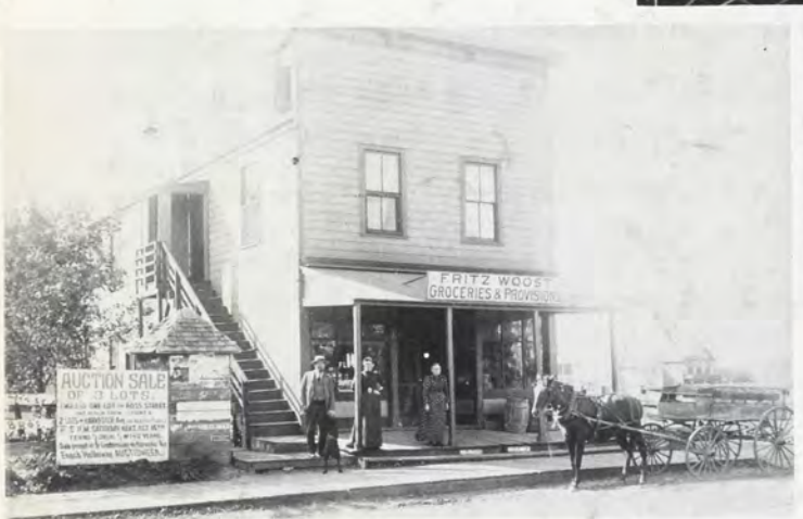
Fritz Woost's grocery. See pages 17-20.