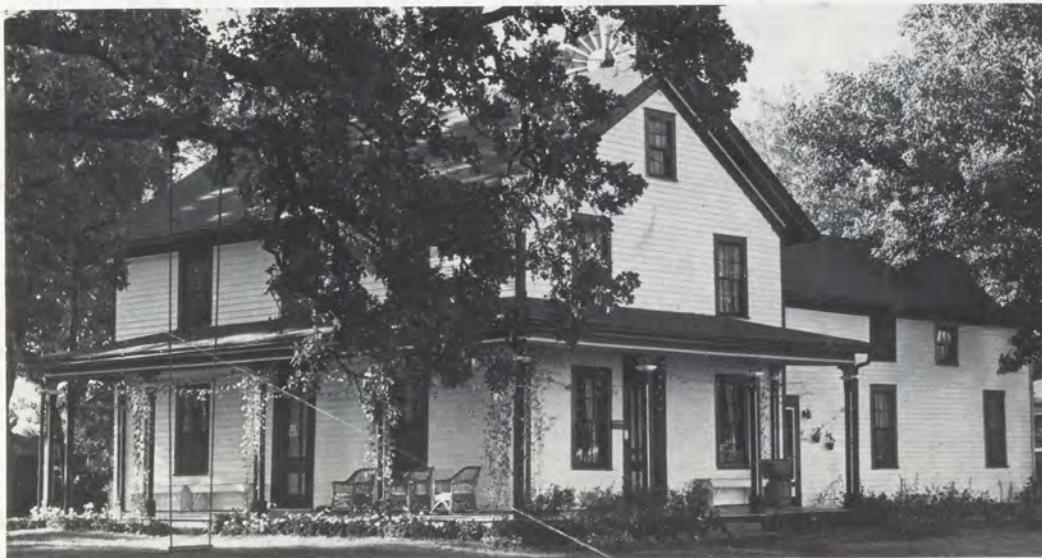
The Gibbs Farm Museum, owned by the Ramsey County Historical Society, at Cleveland and Larpenteur in Falcon Heights.

NON-PROFIT ORGANIZATION U.S. Postage PAID St. Paul, MN Permit #3989