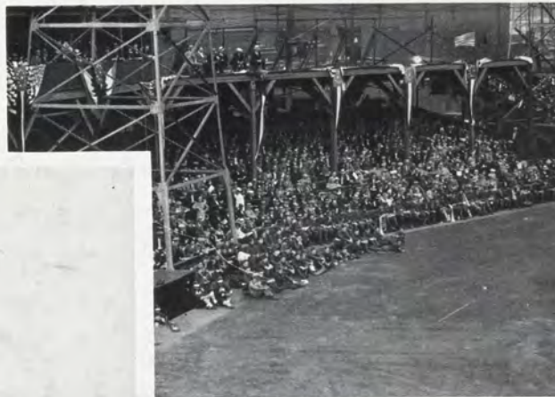
Lexington Ball Park. See pages 21-22.

Ramsey County History published by the Ramsey County Historical Society 323 Landmark Center 75 West Fifth Street St. Paul, Minn. 55102