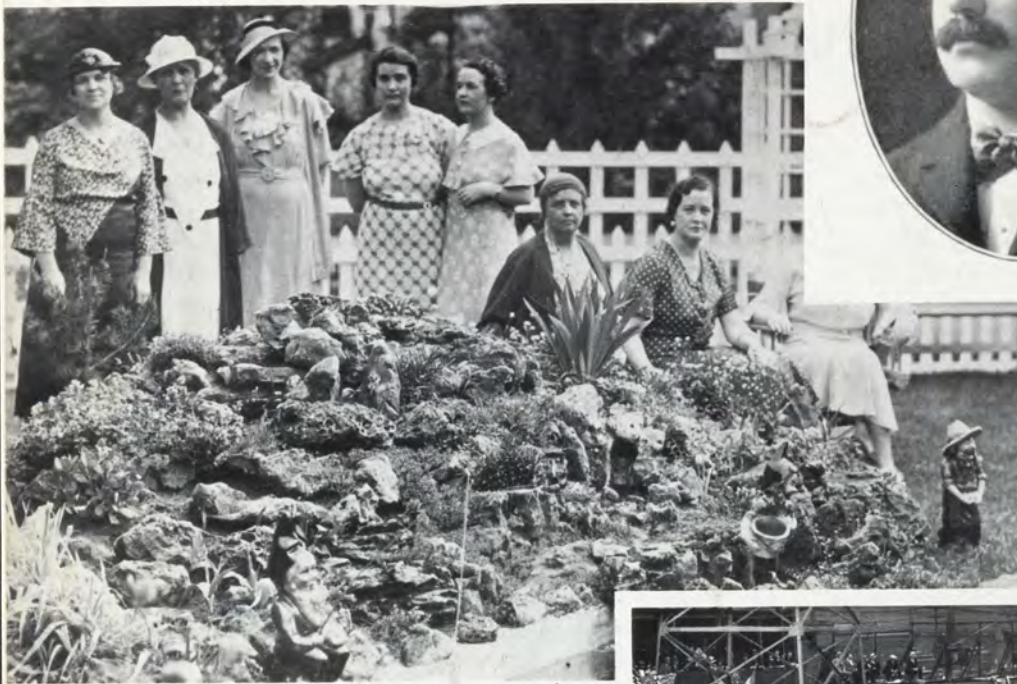
Guild of Catholic Women's garden party. See pages 13-16.