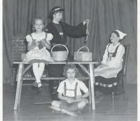
A play staged by St. Agatha's Expression Department. See Page 13. (Can anyone identify these youngsters?)

Passengers on the steamboat, "Red Wing," docked on the St. Paul riverfront, watch the Minnesota Boat Club bantam four race about 1910. See page 20.