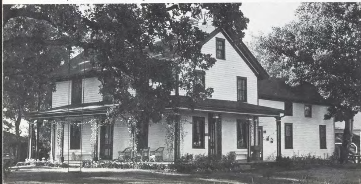
The Gibbs Farm Museum, owned by the Ramsey County Historical Society, at Cleveland and Larpenteur in Falcon Heights.

NON-PROFIT ORGANIZATION U.S. Postage PAID St. Paul, MN Permit #3989