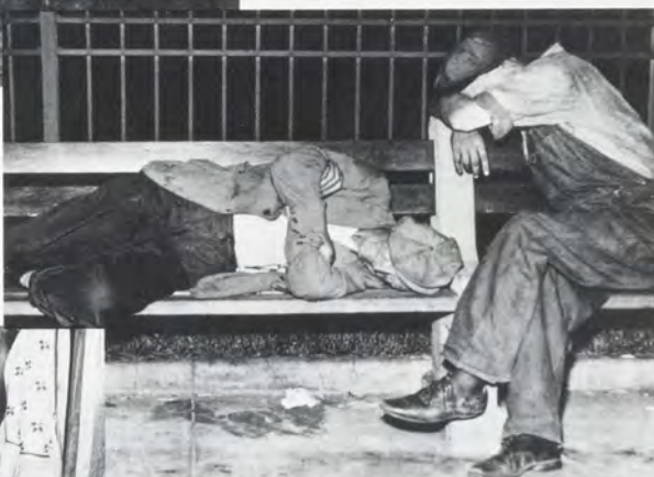
Homeless men during the Great Depression. See page 17.