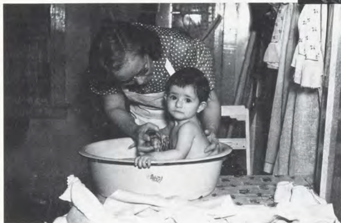
W.P.A. helper bathing her small charge. See page 17.