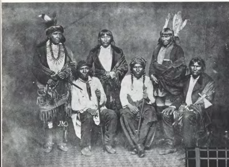
Sioux treaty chiefs on a visit to Washington D.C. See page 3.

Ramsey County History published by the Ramsey County Historical Society 323 Landmark Center 75 West Fifth Street St. Paul, Minn. 55102