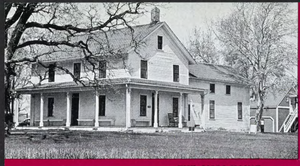
THE GIBBS HOUSE

Headquarters of the Ramsey County Historical Society, 2097 Larpenteur Avenue W., St. Paul, Minn.