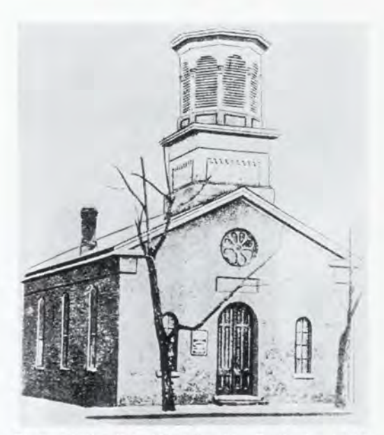
First Methodist Church, St. Paul, in 1849. Also called the Market Street Church, this was the first Protestant church built in St. Paul.

the liberal offer of $200 and ten downtown lots towards the church edifice which offer was accepted."