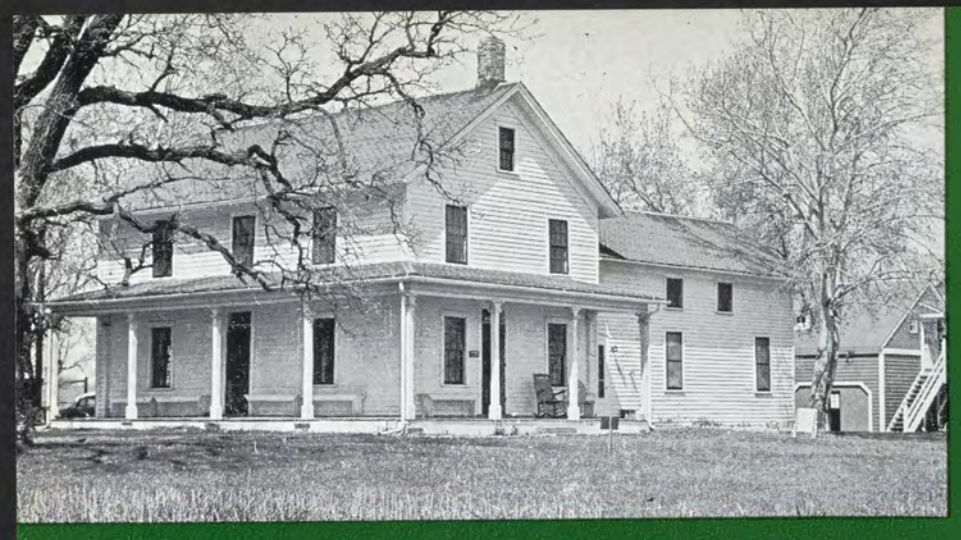
THE GIBBS HOUSE

Headquarters of the Ramsey County Historical Society, 2097 Larpenteur Avenue W., St. Paul, Minn.