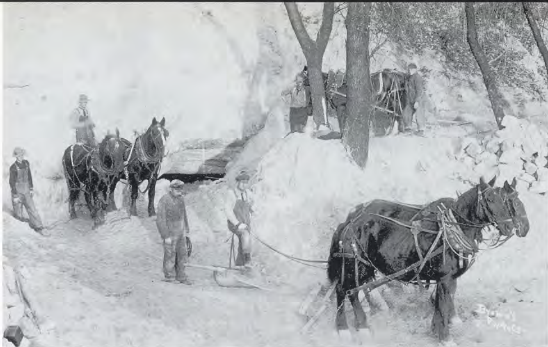
Teams of horses were used in 1913 to scoop rock and debris from mouth of cave, in background.