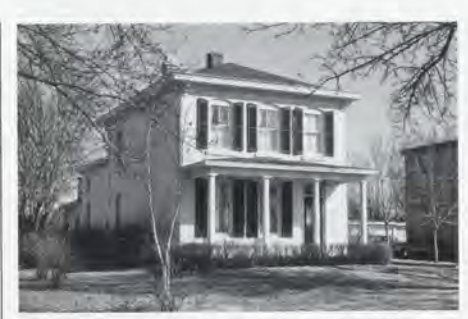
The Wilzbacher farmhouse.

I was driving along Larpenteur Avenue, heading east from Cleveland, when I