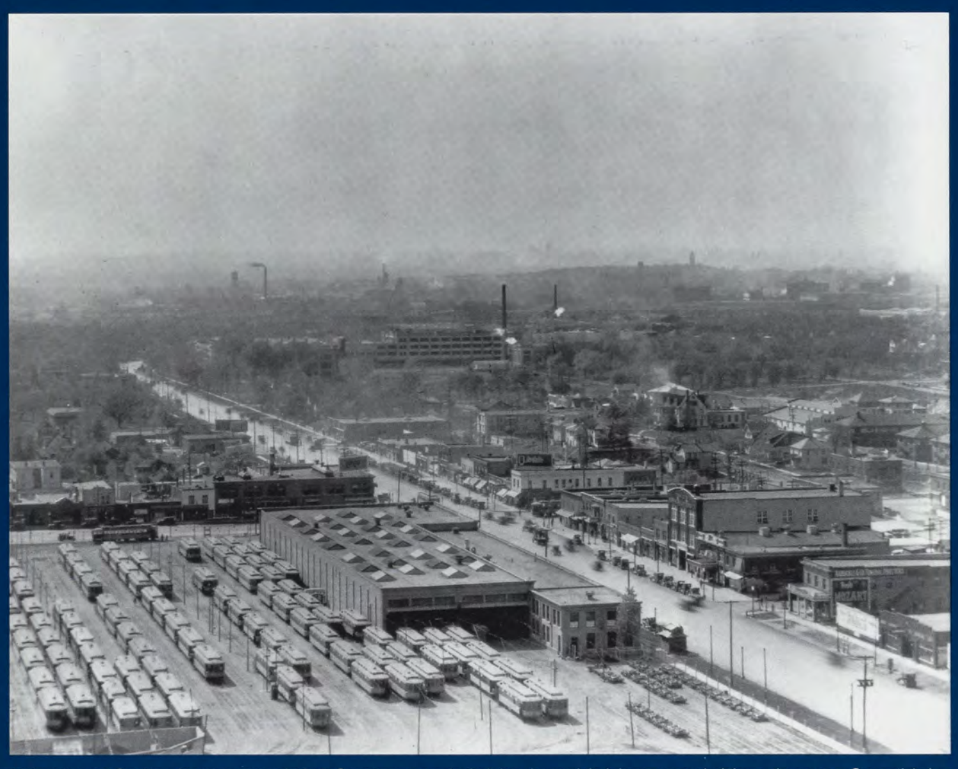
University and Snelling Avenues around 1916. Streetcars were in their heyday and their barns occupied the entire corner. See article beginning on page 4.