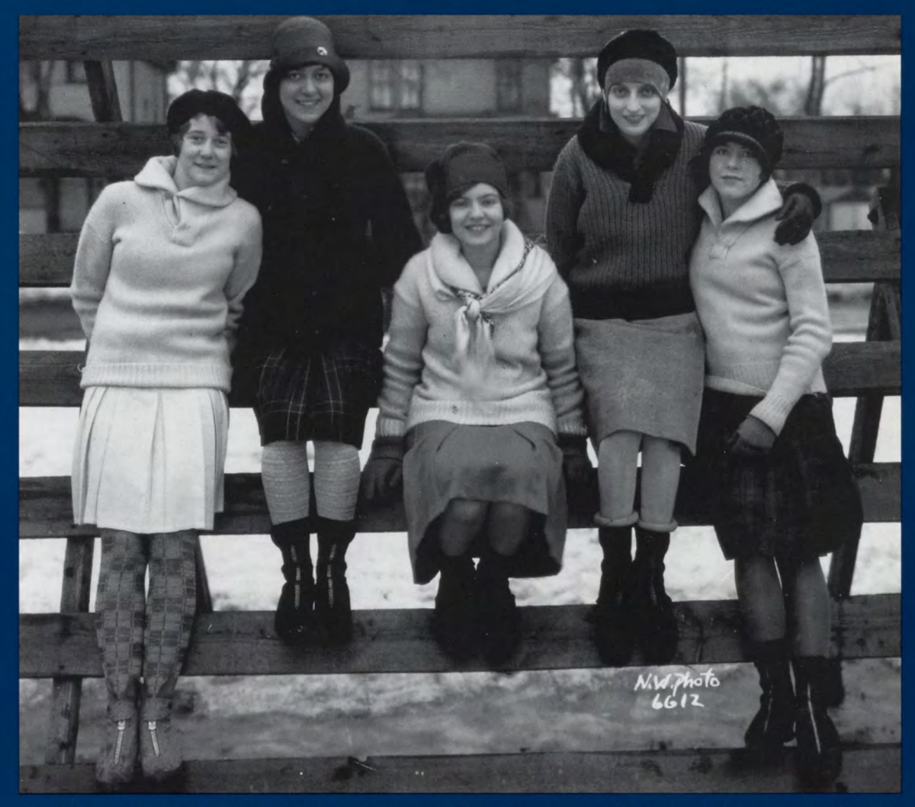
Hamline Park Playground candidates for one of the Midway's Winter Carnivals, probably 1929 or 1930. Can anyone identified these young women? See article beginning on Page 4.