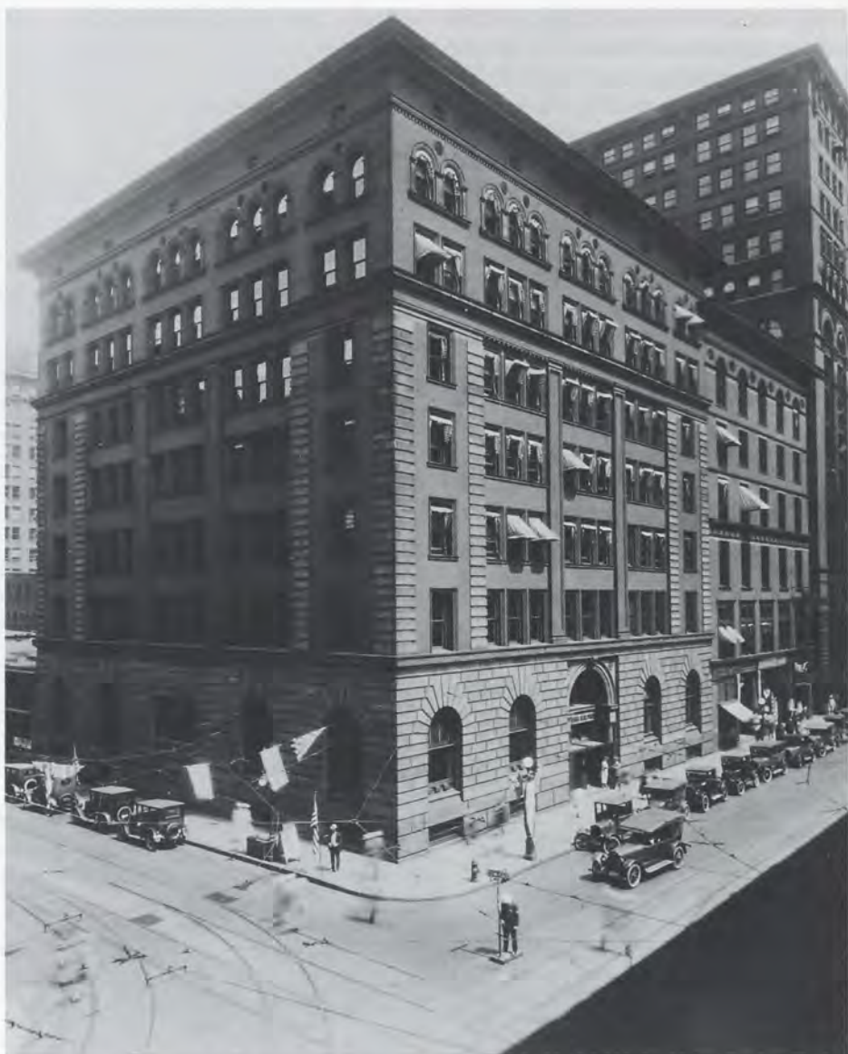
The Empire National Bank of St. Paul at 360 Robert Street around 1929, the year the bank changed its name from the National Exchange Bank to the Empire National Bank of St. Paul.

The Empire National Bank officers, directors, and stockholders are present-day representatives of a long line of pioneers and builders, going back to the 1840s when St. Paul began shipping by Red River Cart northwestward to frontier outposts and into Canada. The institution is under the wise counseling of these men rich in Northwest business experience. Owned and conducted by St. Paul business men to serve St. Paul and its trade territory, the Northwest Em-