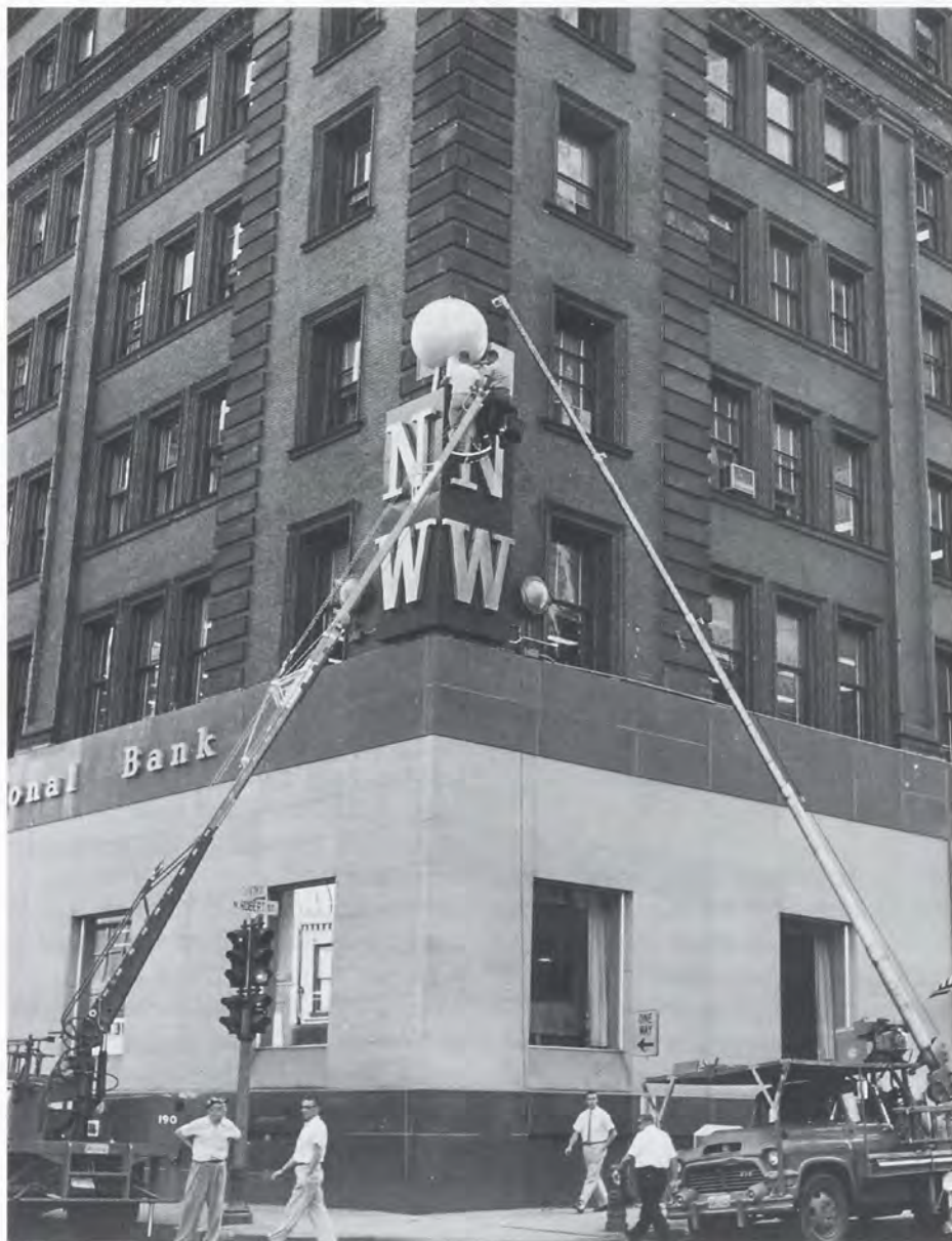
The bank's famed Weatherball on its way up on August 26, 1961. In January, 1959, the name of the bank, still located at 360 Robert Street, was changed from Empire to Northwestern National Bank of St. Paul. Another change came on February 15, 1983, when the bank's name became Norwest Bank St. Paul, National Association (N.A.)

Norwegian, German, and other European languages were commonly spoken in St. Paul, today Spanish and southeast Asian languages are heard and Norwest's St. Paul staff includes employees fluent in those languages. Automated teller machines are bi-lingual and the East Side and Phalen Park banks are equipped with Hmong-language ATMs.