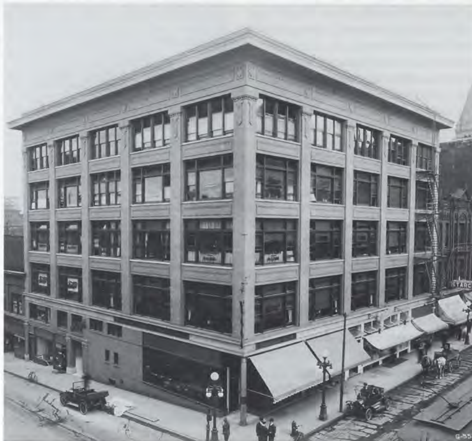
The Peoples Bank, another ancestor of Norwest St. Paul. The Peoples Bank occupied this southeast corner in the Midland Building at Sixth and Wabasha between 1914 and 1921.