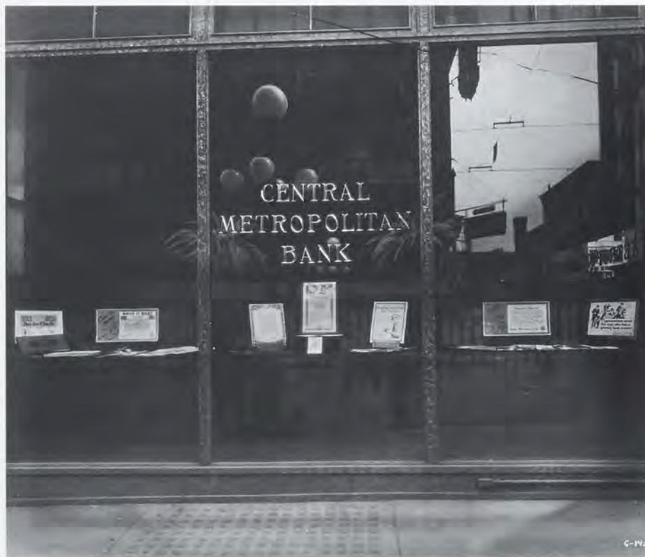
Window display of the Central Metropolitan Bank, in 1924 the largest state bank in Minnesota. Through its merger that year with the National Exchange Bank, Central Metropolitan became still another ancestor of Norwest St. Paul. Central Metropolitan was located at this corner of Fifth and Cedar from 1921 to 1923.

In 1921 another bank joined the parade of Norwest's predecessors when the Peoples Bank merged with the Central Metropolitan Bank. Founded in 1915, the Peoples Bank, at the southeast corner of Sixth and Wabasha, had a capitalization of $350,000. Five years later, capital and surplus stood at $600,000 and its resources at more than $3 million. Reaching out for personal and commercial accounts, the bank unabashedly announced