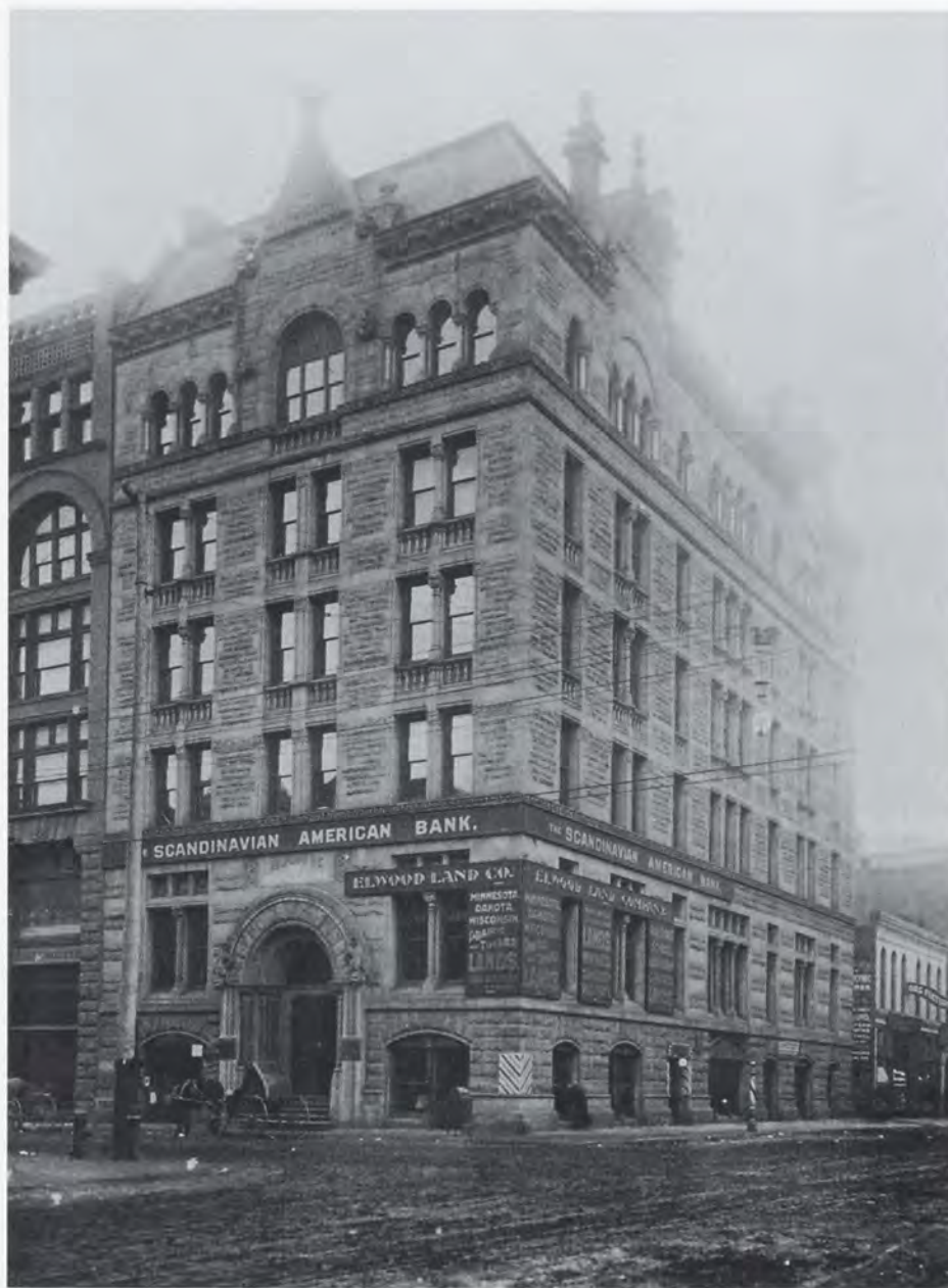
The Scandinavian-American Bank of St. Paul at Sixth and Jackson Street around 1890. Northwest Bank's history in St. Paul begins with this bank, which was chartered on June 29, 1887, and claimed the oldest state banking charter in Minnesota.