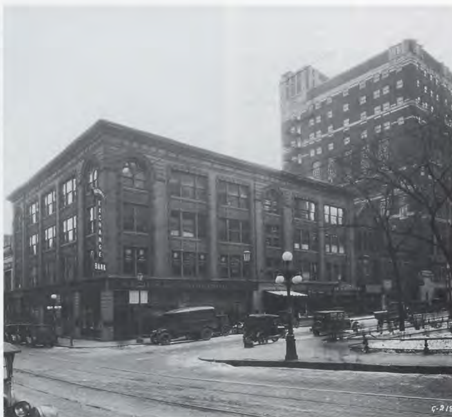
National Exchange Bank at Fifth and Cedar in 1926. The bank was listed at this address in the St. Paul City Directories for 1924 and 1925, only. Since a 1926 auto license plate is visible in the photograph, the bank may have moved a block east to Fifth and Robert early that year.