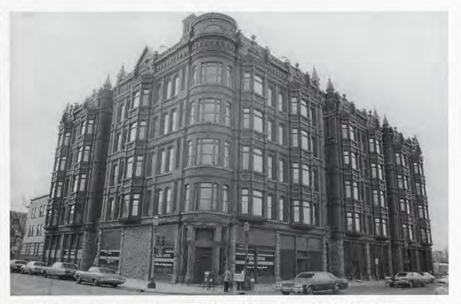
The Blair Flats, photographed in 1980.