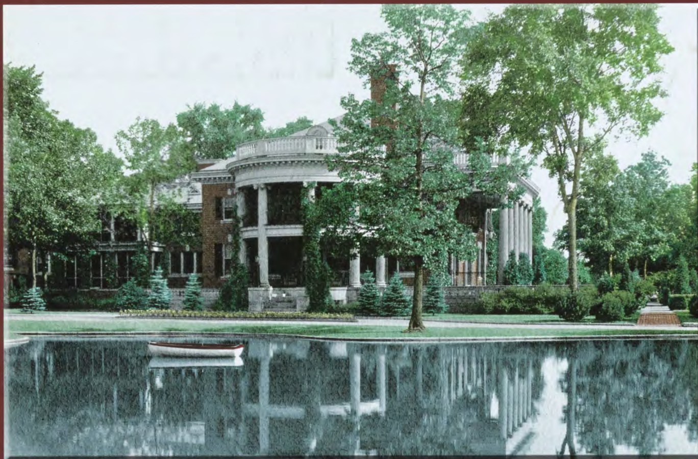
Stonebridge, one of Ramsey County's largest and most elegant homes. See article beginning on page 4.