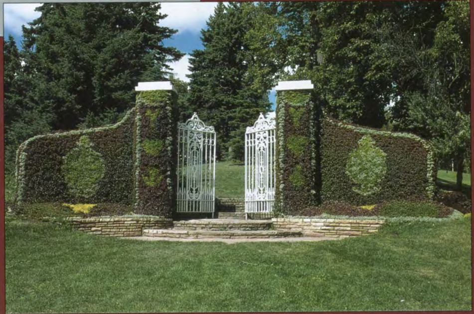
Below: The wrought-iron pedestrian gates were moved to near Lake Como and are frequently used for wedding pictures.

R.C.H.S. RAMSEY COUNTY HISTORICAL SOCIETY