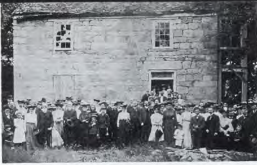
Before and after—Restoration of the Sibley House by the Minnesota Daughters of the American Revolution.