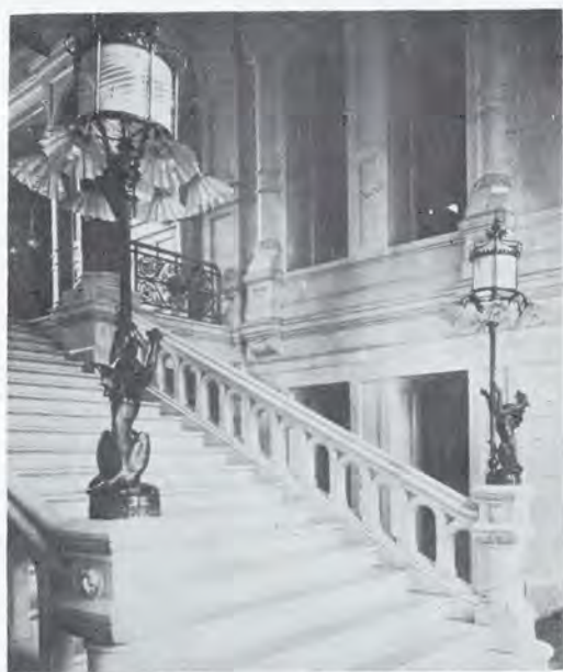
Italian marble was used for the stairs, flooring and casings in the entrance halls of the Guardian building.

“modern” and too young to be thought “picturesque.” 9