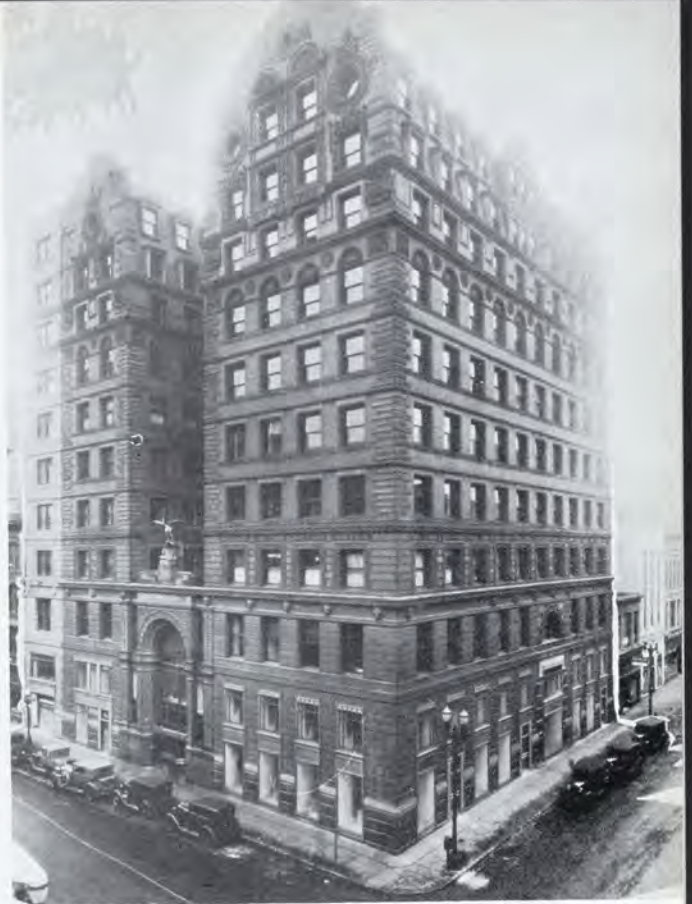
The New York Building shows a distinctly "Hanseatic" or northern German influence in design.

torian era were constructed in the decade of St. Paul's biggest building boom, between 1888 and 1898. This was a lavish period in which New York, Boston and Chicago architects often were commissioned to design St. Paul's most ambitious buildings, and James J. Hill imported Swiss and Italian artisans to work on his $200,000 Summit Avenue mansion.