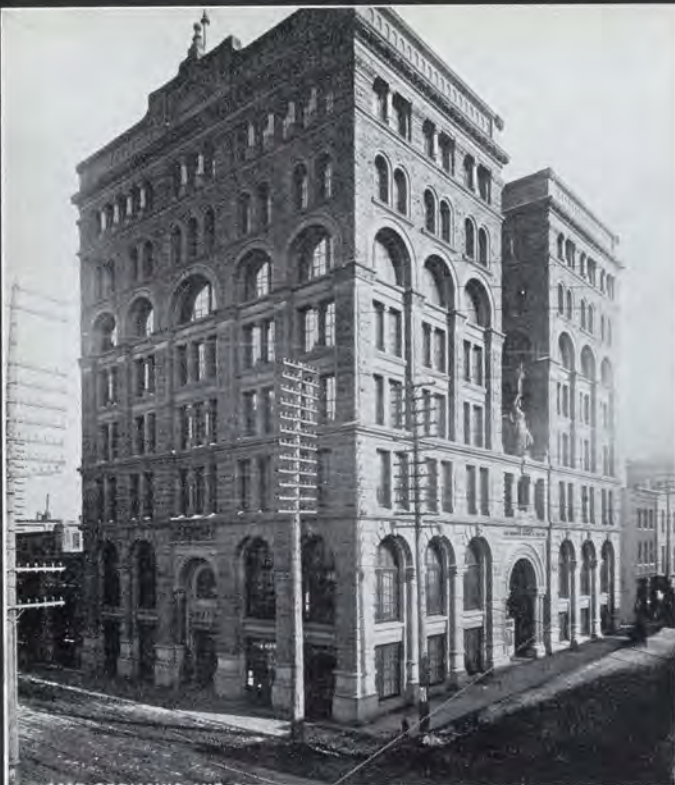
The Guardian Building, once known as the Germania Building, is shown in this pre-World War I photograph.

crete, composed of small stones and Portland cement fourteen feet broad and three feet thick, upon which rest large footing-stones battering on an angle of sixty degrees to the thickness of the walls. This formation is built strong enough that at any time the building can be carried to the height of twelve or fourteen stories. The superstructure is built to the top with granite and Portage Entry stone. This building is strictly fireproof, with iron beam construction and tile floor arches. The entrance halls are finished in Italian marble and all stairs, flooring and casings are of the same material. All doors are made of fire-proof material and the elevators are finished in old brass. Every room is provided with a vault and fireplace, and heated and ventilated by steam in the most approved manner, and one feature of this building is that every room has outside light and air.