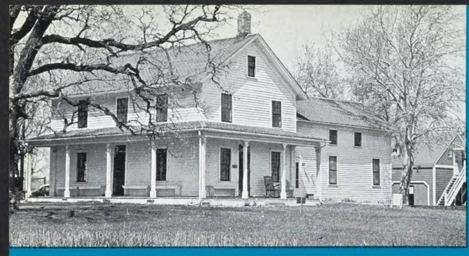
THE GIBBS HOUSE

Headquarters of the Ramsey County Historical Society, 2097 Larpenteur Avenue W., St. Paul, Minn.