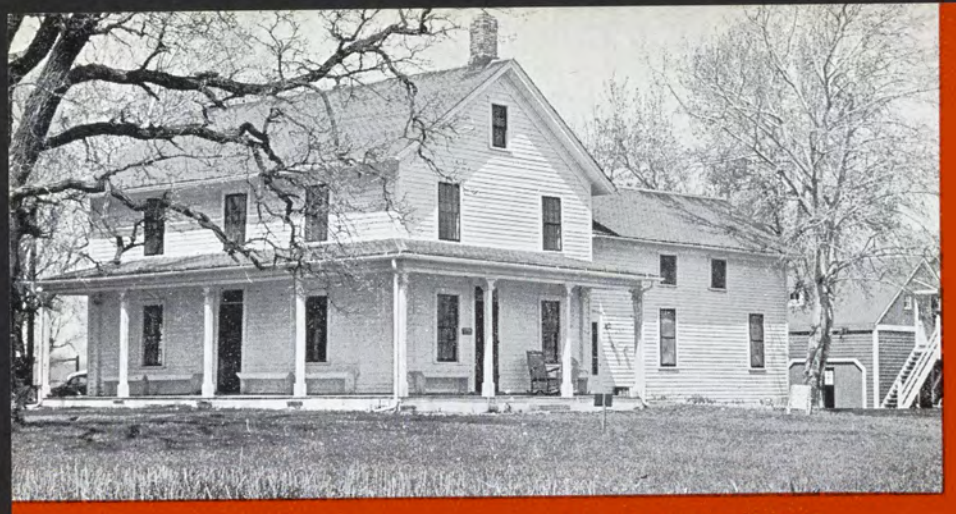
THE GIBBS HOUSE

Headquarters of the Ramsey County Historical Society, 2097 Larpenteur Avenue W., St. Paul, Minn.