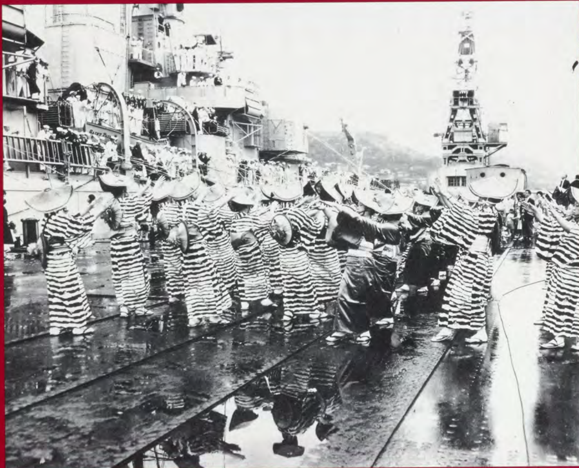
Women from the Yokosuka, Japan, Folk Dance Association perform Japanese folk dances for U. S. S. St. Paul crewmembers as the heavy cruiser prepares to leave Yokosuka for the United States on July 6, 1962. See article beginning on page 4.

D-Day Remembered By Seven Who Were There