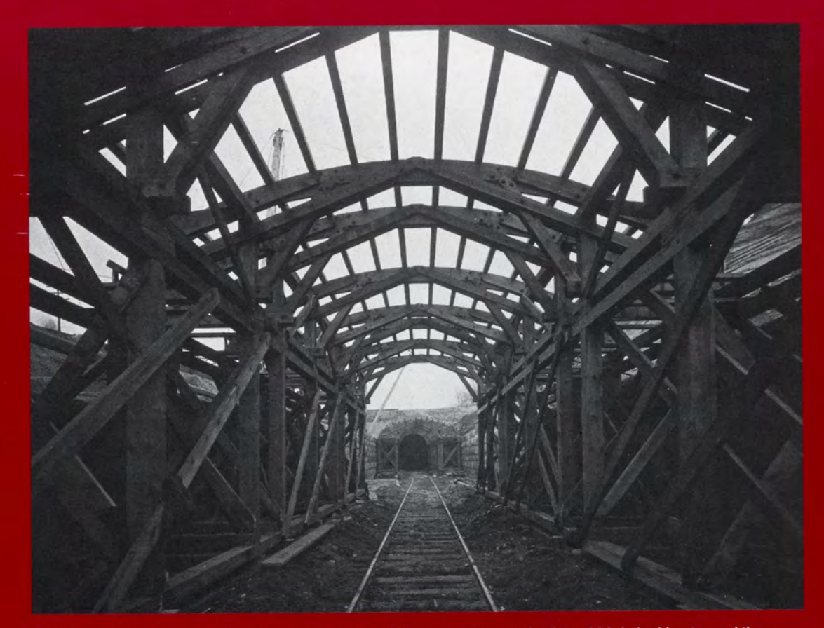
Centers for the flat arch of the Westminster tunnel. This view, taken on April 9, 1886, is looking toward the south. See article beginning on page 9.