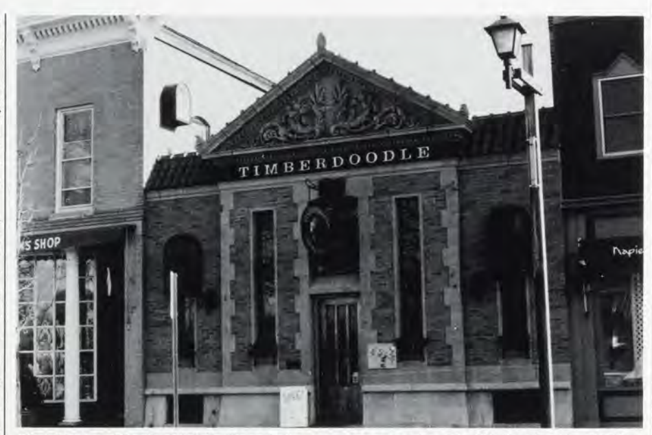
First National Bank of White Bear Lake, now renovated as the Timberdoodle clothing and gift store.

In the 1850s, several settlers launched the beginnings of a resort community that, for the next thirty years, attracted vacationers from throughout the Midwest. Beginning in the 1890s, streetcar lines connected White Bear Lake with St. Paul and