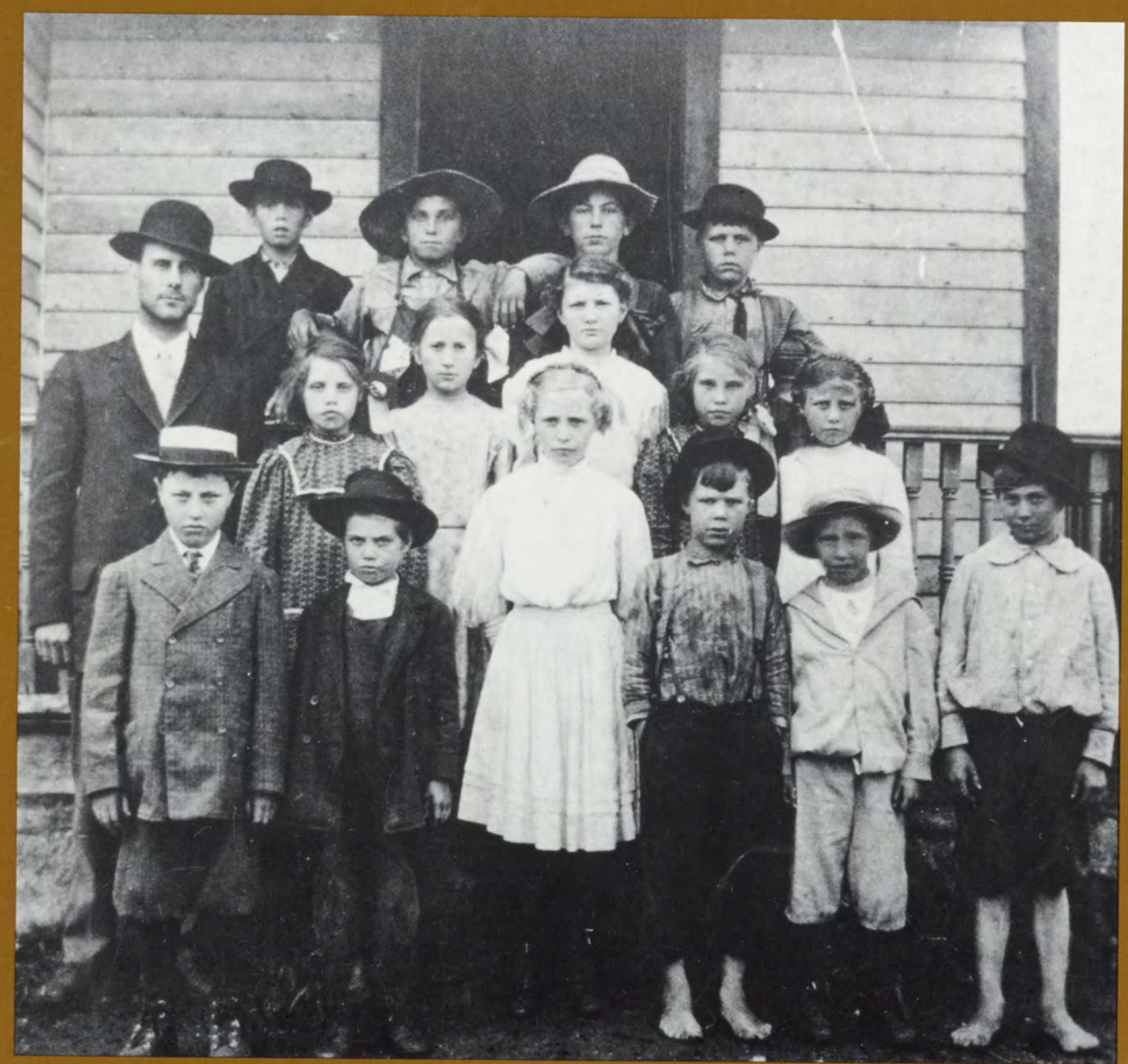
Education was a serious matter in 1911 when these boys and girls attended the Stoen School on the western prairie of Minnesota. It has been preserved and restored as the one-room country school at the Ramsey County Historical Society's Gibbs Farm Museum in Falcon Heights. See the articles beginning on Page 4.