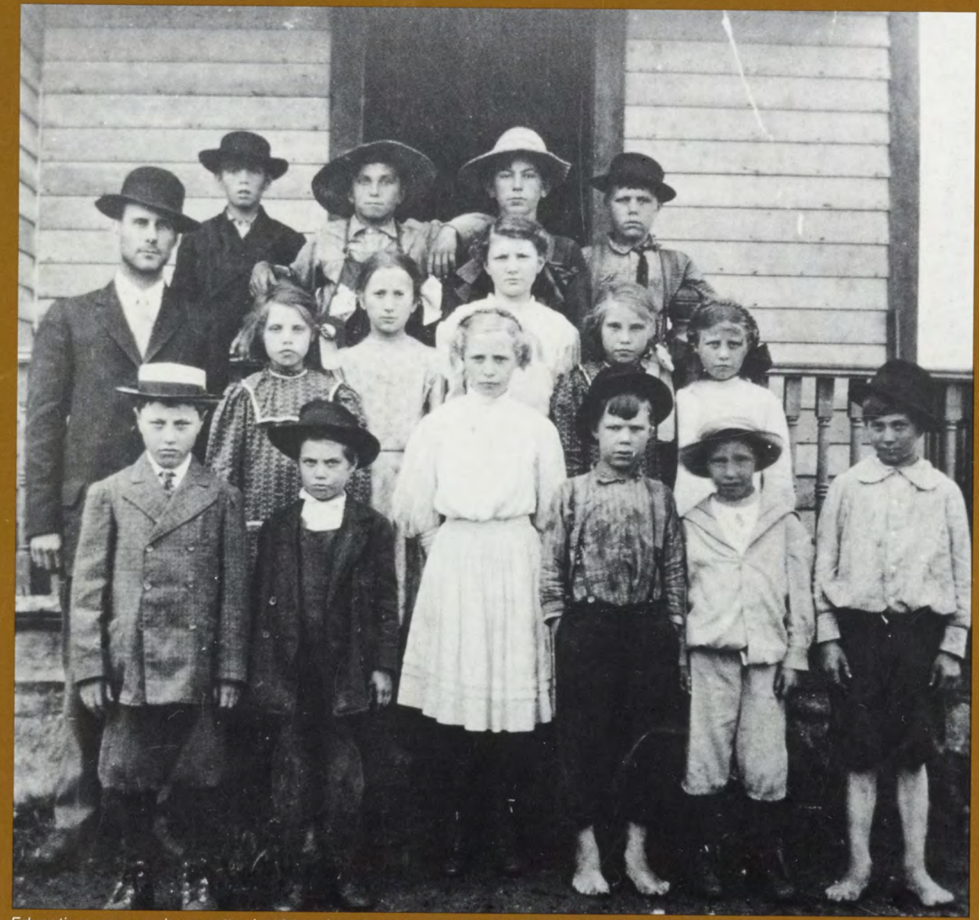
Education was a serious matter in 1911 when these boys and girls attended the Stoen School on the western prairie of Minnesota. It has been preserved and restored as the one-room country school at the Ramsey County Historical Society's Gibbs Farm Museum in Falcon Heights. See the articles beginning on Page 4.

A Publication of the Ramsey County Historical Society