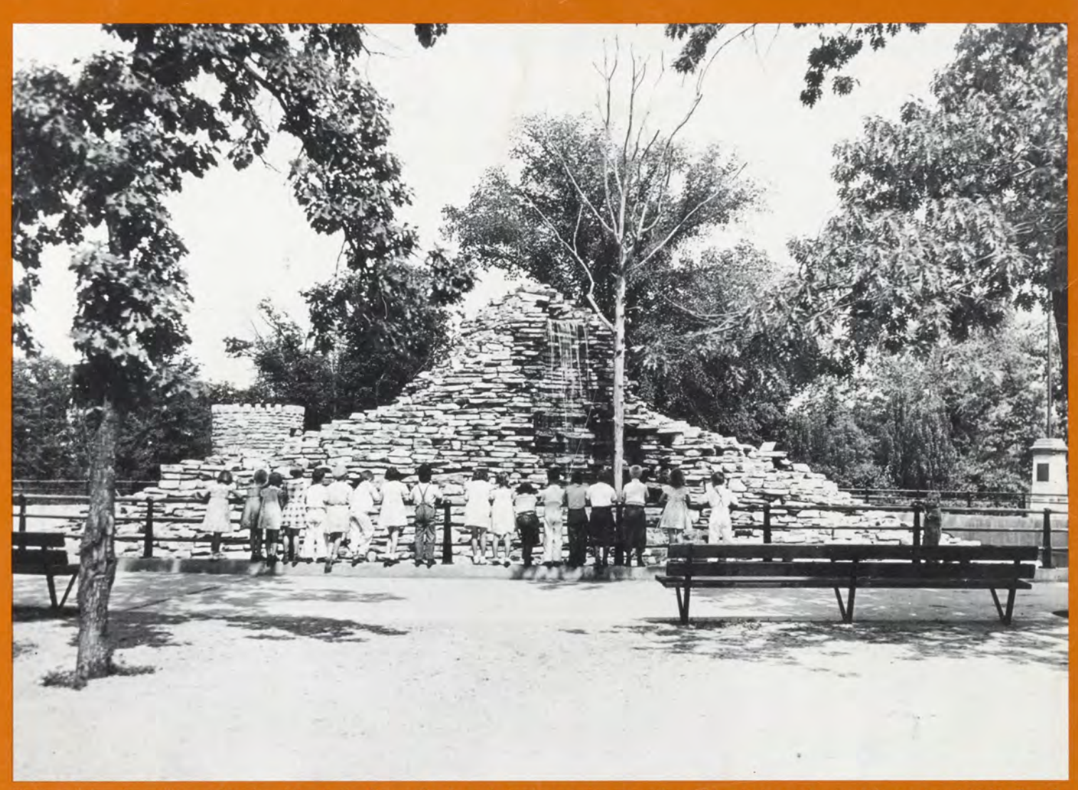
Visitors lining the railing at Monkey Island, the Como Zoo's enduringly popular attraction. This photograph was taken around 1940. See the article on Growing Up in St. Paul, beginning on page 16.