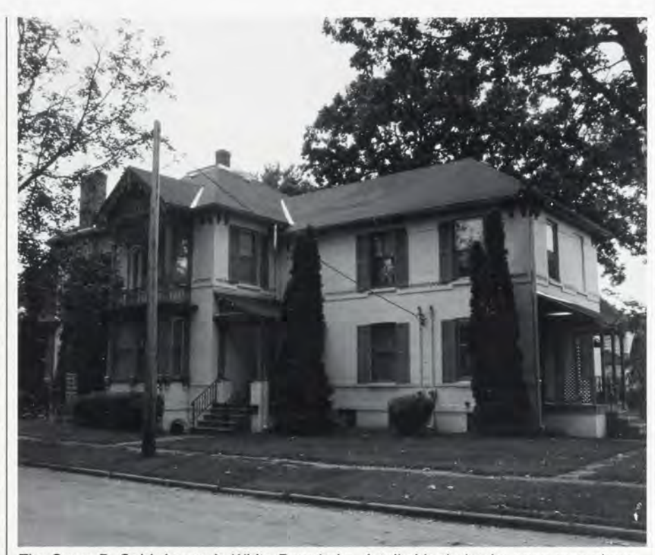
The Cyrus B. Cobb house in White Bear Lake. A tall shingled spire once rose above the canted southeast corner of the house.

in All About White Bear Lake, first published in 1890. The drawing reveals that there was once a tall, shingled spire which rose above the canted southeast corner of the house. The original open entrance pictured in the drawing had a balustrade and fretwork. Above the entrance to the porch there was a secondstory gabled roof open porch with fretwork and balusters similar to those on the first floor level.