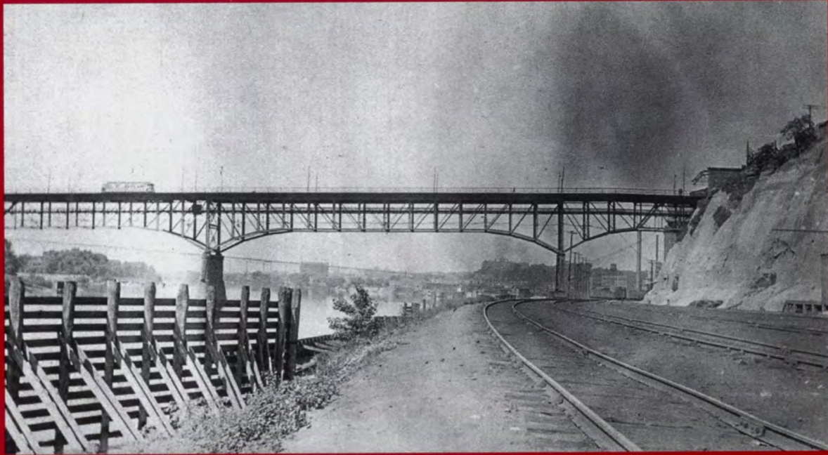
Another view of the 1888-89 Wabasha street bridge. See article starting on page 4.

R.C.H.S. RAMSEY COUNTY HISTORICAL SOCIETY