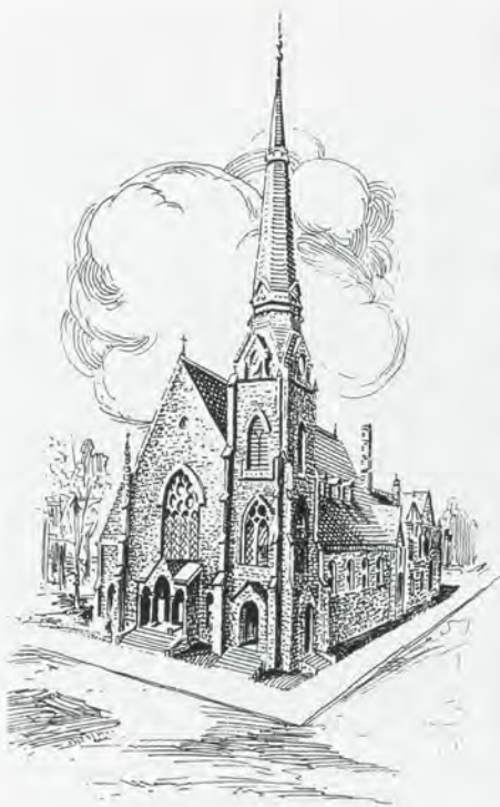
First Baptist Church at Ninth and Wacouta Streets in St. Paul's Lowertown.