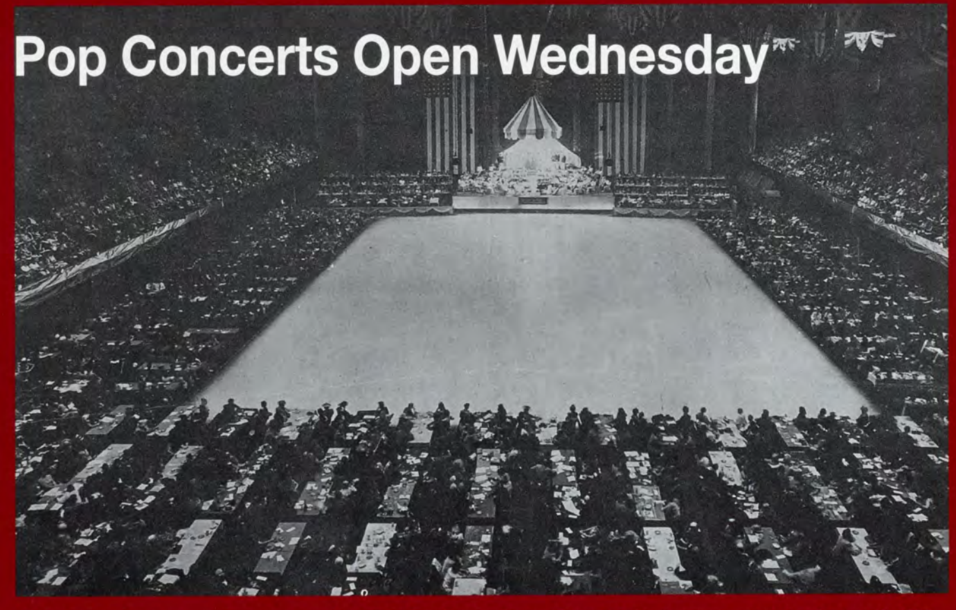
St. Paul's Pop Concerts were famous nationwide, the St. Paul Sunday Pioneer Press noted in its rotogravure section for July 18, 1943. "Literally the only show of its kind in the world," the newspaper reported that the St. Paul Pops was a cooperative venture. St. Paul supplied the Auditorium arena, the Figure Skating Club the talent "for the spectacular ice shows," the Civic Opera provided the chorus, and the Musicians' Association the seventy-piece orchestra, many of them members of the Minneapolis Symphony." See article beginning on page 4.