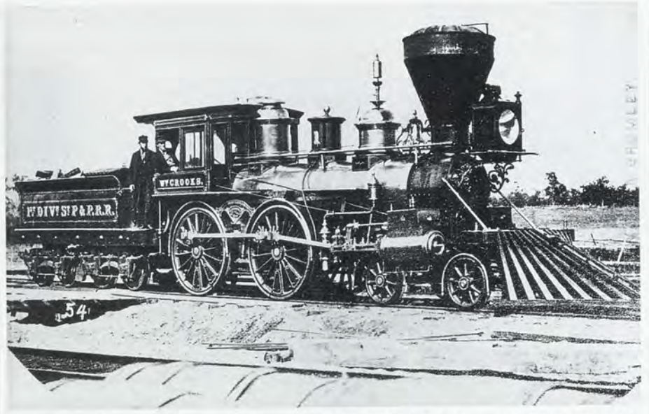
The "William Crooks," shortly after its arrival in St. Paul in 1861. From a postcard in the collections of the Ramsey County Historical Society.

I'm interested in the history of Minnesota's Native Americans and the role of the women. They seem to have carried a great load in providing for their