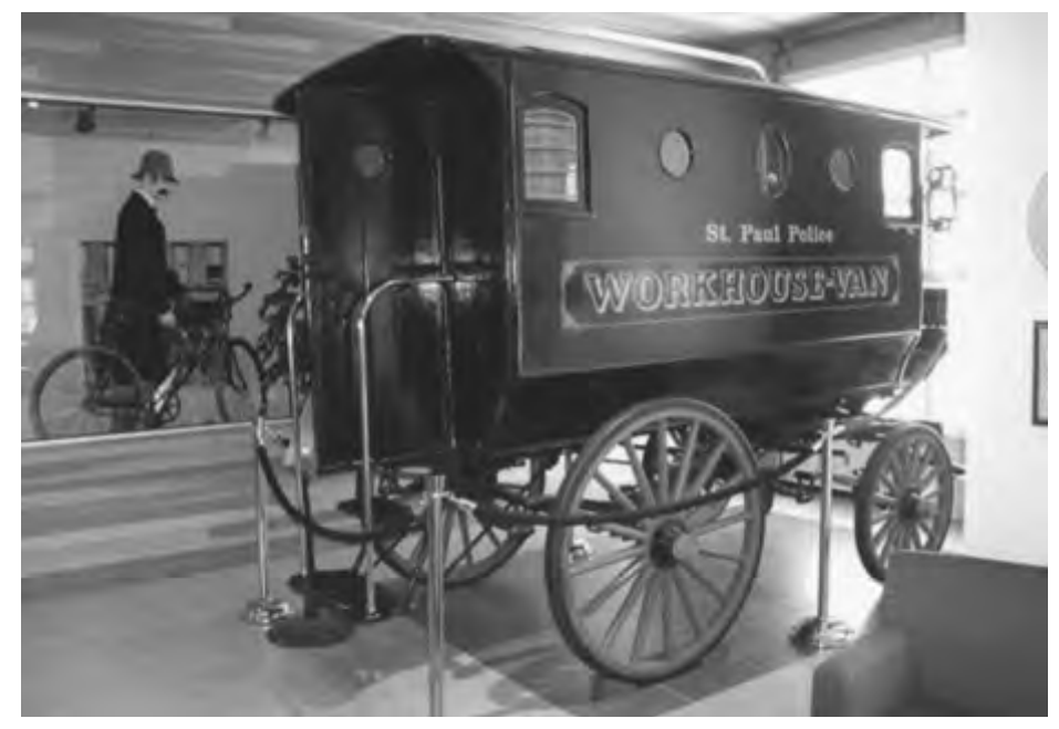
The restored "Black Maria" or workhouse-van of the Saint Paul Police Department is now on display at the Department's Western District Office in St. Paul alongside a display that features an 1897 bicycle patrol officer.

Although surviving records do not provide an exact date when the carriage was retired from service, it was probably replaced by a motor-driven unit sometime after 1914, the year the city started replacing its horse-drawn patrol wagons with motorized vehicles. Some documents suggest that the workhouse-van was one of the last of the carriages to be