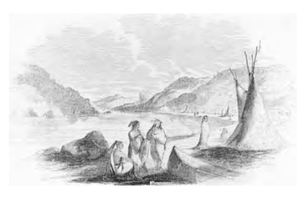
A Dakota encampment at Kaposia.

As soon as the Sioux were informed of this horrible murder, transported with fury, they