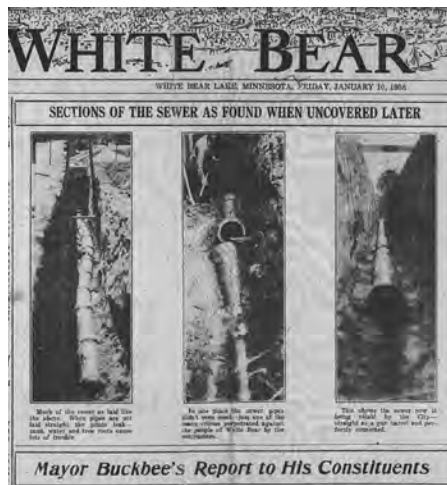
A headline and three photos on the front page of the January 10, 1936 issue of the White Bear Press reminded residents of the many problems the city encountered when its sewer system was installed. The photo on the left shows sewer pipes that were not laid straight, which caused them to leak at the joints. The middle photo shows pipes that were not joined at all. The final photo shows the pipes after they were relaid by city workers.

At the same time, the City was also working on a public relations campaign to demonstrate to the citizens how it was handling the sewer cases. In August it ran an open letter in the Press that put the delays squarely on Kennedy's shoulders because of "internal troubles" at Kennedy and the firm's "lim-