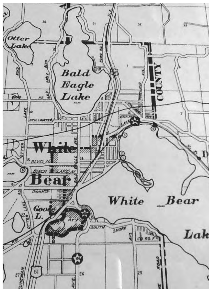
In 1935 when this highway map of White Bear Lake was made, the city’s downtown area was not as developed as it is today. The proximity of Goose Lake to its much larger neighboring lake is easy to see. In addition the heavy black line in the upper right-hand corner shows how much of the city of White Bear Lake was located within Ramsey County at the time the sewer system was installed.

The sewer would be paid in part from assessments and the average assessment for fifty feet of frontage on a city street would be $87 spread over a ten-year period. Because there was insufficient gravity for proper flowage, two lifts were factored into the sewer’s scope. When the bids were opened, W.E. Kennedy of Fargo, North Dakota, was the lowest qualified bidder at $167,544. When additional money for land acquisition, easements, advertising, and legal expenses was included, the entire project was projected to cost slightly more than $198,000 (which equates to over $2.5 million in 2012 dollars). 10 The official award of the bid occurred at the July 20 council meeting, and Kennedy was awarded the contract by a 4–0 vote with Councilman Palmer abstaining. The only caveat the council added to the contract was that Kennedy was to employ as many local workers as possible, a condition Kennedy agreed to. He also agreed to live in town during the construction. 11