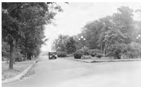
In 1924 when this photo of Clark Avenue was taken, the streets in the residential areas of White Bear Lake were typically wide and bordered by trees and shrubs. Usually these physical circumstances would make the installation of a city sewer system less difficult.