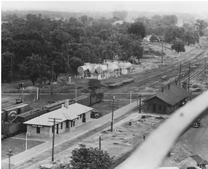
In this aerial photo from 1935 the wooden area adjacent to the rail yard separated the tracks from the place where quicksand supposedly hindered sewer installation.

While the Press continued to support the sewer project and report on its progress, by December 1926 local citizens voiced their first grumblings on the sewer’s actual progress. A citizen’s committee was created and though the Press reported it was “friendly to sewer construction,” it nevertheless began to raise important ques-