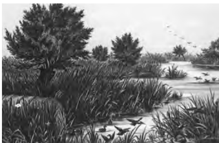
This sketch of Goose Lake from about 1885 shows just how swampy the lake had become once residents began pumping its water into White Bear Lake in the years preceding sewer construction.