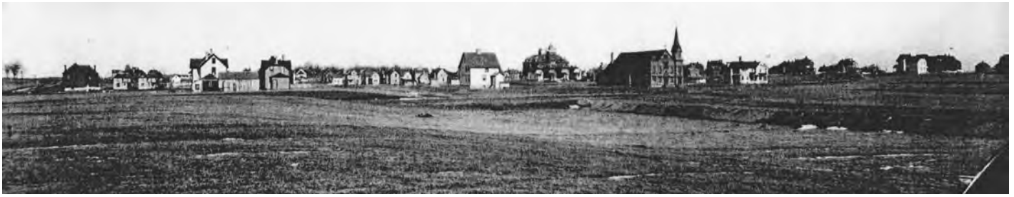
The sprouting “garden suburb” of Merriam Park is shown in this 1890 photo of the developing neighborhood, the spire of the first St. Mark’s church built a year before in the distance. Situated midway between both downtowns, Merriam Park was prime real estate for residential development and transportation links.

in communities in the freeway’s path. Freeway construction had far-reaching impacts on neighborhoods and urban regions. Freeways made the commutes between city and suburb much quicker, furthering the flight of citizens and businesses away from core cities. In the process, previously cohesive neighborhoods were divided and in many cases destroyed.