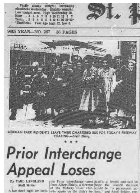
The smiles tell the winners' story. Cheerful Merriam Park women assemble at city hall prior to the final St. Paul City Council vote on the I-94 freeway accord. At a time when men predominated in public affairs, women played important roles during the three-year campaign, turning out at public hearings, writing letters, conducting petition drives, and in other ways nurturing these grass-roots efforts. St. Paul Dispatch photo, March 6, 1962. Photo courtesy of the Minnesota Historical Society.

reflected this national commitment. The Federal agency in charge, the United States Bureau of Public Roads, long proposed freeways as linchpins to the future of American cities, and by the late 1940s the Federal government was responding to the demands for jobs, housing, education, and improved transportation. A war weary but growing American populace supported a fast pace, and in the years leading up to the 1962 St. Paul council vote, Minnesota officials had finalized most of St. Paul’s freeway plans. 4