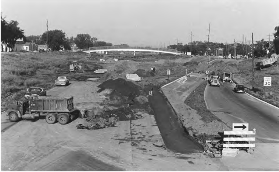
Construction of I-94 as seen in about 1964 from the Snelling Avenue interchange looking west toward the pedestrian bridge in the background.

Avenue. The visual image of 1,500 children stretching the five blocks from school to the proposed freeway exits further galvanized the neighborhood. The Association's "David versus Goliath" image was growing. 26