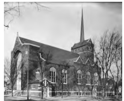
Pittsburgh architect John T. Comes designed the present St. Mark’s Church in the distinctive English Gothic style. First services were held in November 1918, although the opening was delayed a week when the city closed all churches due to the flu epidemic. The flagship parish of its time, over 1,500 elementary-age students attended St. Mark’s school when the freeway was built in the 1960s.

missed opportunity for the new community of Merriam Park. Colonel Merriam’s son, William R. Merriam was governor of Minnesota from 1889 to 1893. Expecting a favorable outcome, backers of a Merriam Park state capitol site offered land from what is now the Town and Country Golf Club for construction of the capitol. Proponents of a unified Minneapolis and St. Paul, one city rather than two Twin Cities, enthusiastically backed the proposal. And for this purpose, Merriam Park was perfectly located, almost precisely at the midpoint of the two cities and only a twelve-minute train ride from either downtown. When the legislature chose the present site for the state capitol just north of downtown St. Paul, the future of Merriam Park as a residential neighborhood was set. By 1916, the community was completely built up. Although the grandest dreams of