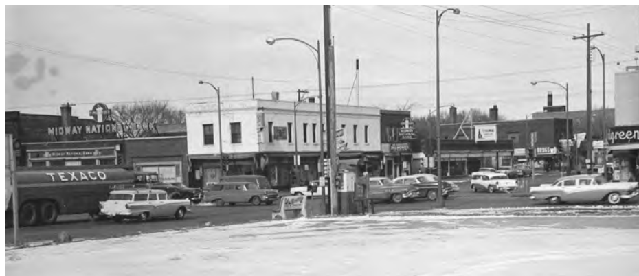
As this 1959 photo of Snelling Avenue looking northwest toward University Avenue documents, heavy traffic on city streets was a common problem as the volume of cars and trucks increased after World War II. Advocates for the I-94 freeway, with its multiple exits into the city and neighborhoods, thought the interstate offered the best way to facilitate quick transfer of commercial goods and ease access for shoppers and commuters.

His knowledge of St. Paul, both organic and learned, contributed to a long