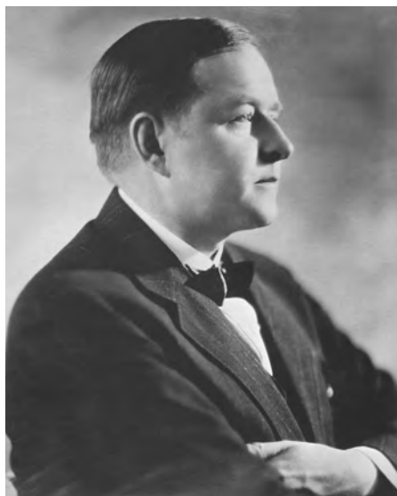
Edward H. Bennett was a leading figure in American urban planning during its early years. He and his Chicago firm produced the Plan of St. Paul in 1922, much of which the city implemented in the 1930s.

The fair was a vast extravaganza of neoclassical architecture on 668 acres on Lake Michigan, with lagoons, canals, and more than 200 temporary buildings, all painted white, resulting in the name "White City" for the site. The basic statistics were staggering. The dome of the Administration Building was 277 feet, topping the height of the U.S. Capitol. The Manufacturers and Liberal Arts Building measured 787 by 1,687 feet, making it the largest roofed structure in the world. The newly invented Ferris Wheel rivaled the Eiffel Tower in Paris. Thirty-six countries and forty-six states and territories participated in the six-month event, at a construction cost of $28 million (more than $700 million in 2014 dollars), and drew 21.5 million paid visitors. Almost everyone agreed the fair was one of the wonders of the world. 2