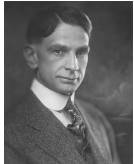
Laurence C. Hodgson (1874–1937) was a strong advocate for urban planning in St. Paul during his two terms as mayor (1918–1922 and 1926–1930).

Starting with New York City in 1916, zoning laws were widely adopted in the U.S. by 1921. As described later, St. Paul followed in 1922. The concept was upheld by the U.S. Supreme Court in 1926, in spite of a dissent by then Justice Pierce Butler. 13