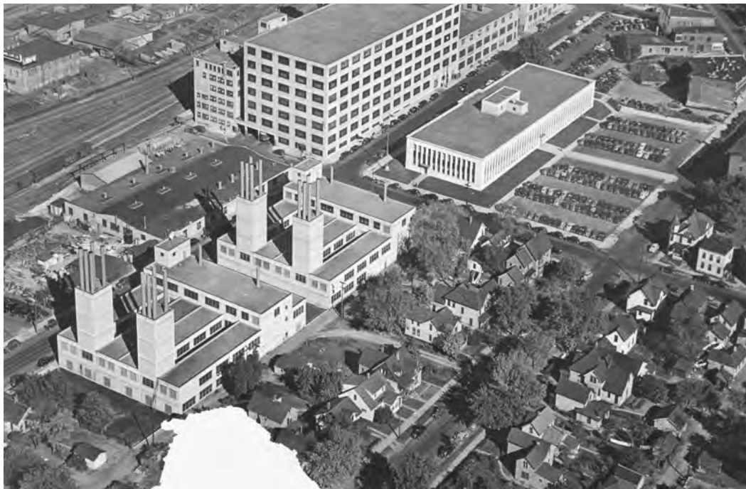
Minnesota Mining and Manufacturing Company (3M) expanded its presence on St. Paul's East Side in the 1920s. Today the only 3M building that remains on this site as seen in this aerial photo from 1924 is the handsome, white, low-rise headquarters building in the right center.