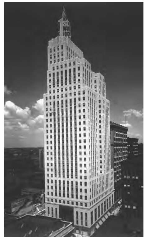
Constructed in 1931, the First National Bank Building is still an imposing structure in St. Paul. Designed by an architectural firm in Chicago, construction of the bank took a year and at 402 feet in height with another one hundred feet for the lighted 1st sign on the roof, it was the tallest building in the city until 1985 when the Jackson Tower at Galtier Plaza was completed.

St. Paul’s massive public works program of the 1920s and ’30s, together with the impact of an expanding population and the new automotive age, spurred the city’s business community to undertake its own unprecedented building