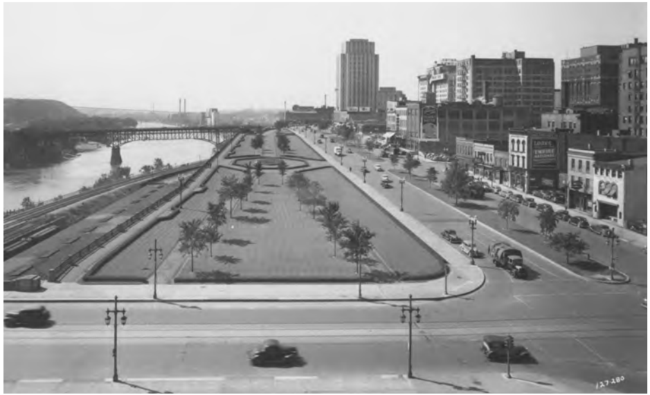
This photo from 1936 shows just how impressive the Third Street Esplanade was when it was first proposed in the 1922 Plan of St. Paul. Today Third Street is known as Kellogg Boulevard.

Under the campaign slogan "Answer the Call for a Better St. Paul," voters passed the bond issue by a wide margin on November 6, 1928. The State Legislature provided the requisite approval and the bonds were quickly sold to investors. It was a close call, as the stock market crashed ten months later on October 29, 1929, and the municipal bond market collapsed shortly thereafter. But the city now had the money