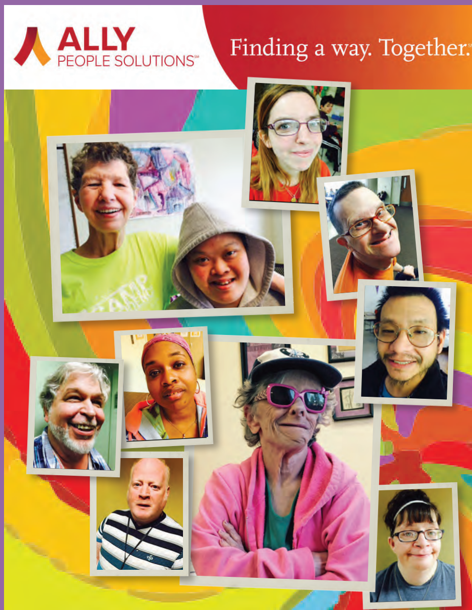
Photo collage and images used from ALLY People Solutions 50th Anniversary Groovy Gala 1965–2015.