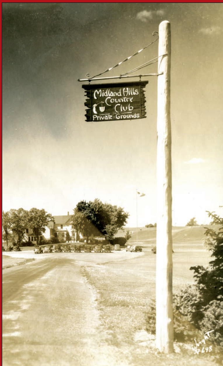
The entrance to the Midland Hills clubhouse in 1921 was by means of a gravel road that crossed in front of the old third tee.

U.S. Postage PAID Twin Cities, MN Permit No. 3989