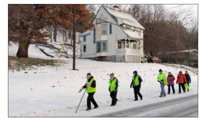
The group made it to a former schoolhouse converted into a single-family home on Point Douglas Road and then turned around and headed home.